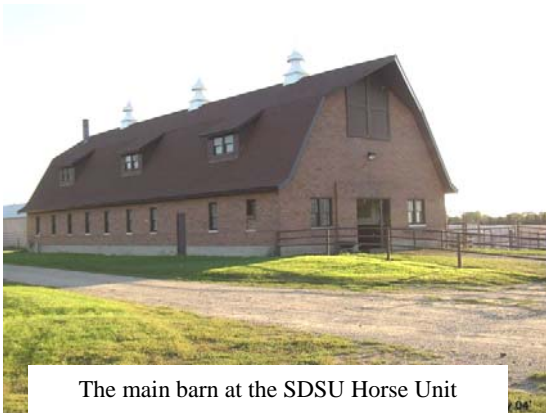
The main barn at the SDSU Horse Unit

The following text is from page 7 of the program celebrating 50 years of Breeding American Quarter Horses, held at the American Quarter Horse Heritage Center & Museum in Amarillo, TX on October 11-12, 2005.